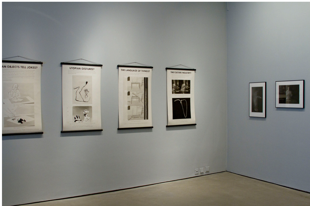
Small gallery - wall charts and chronocyclograph photographs