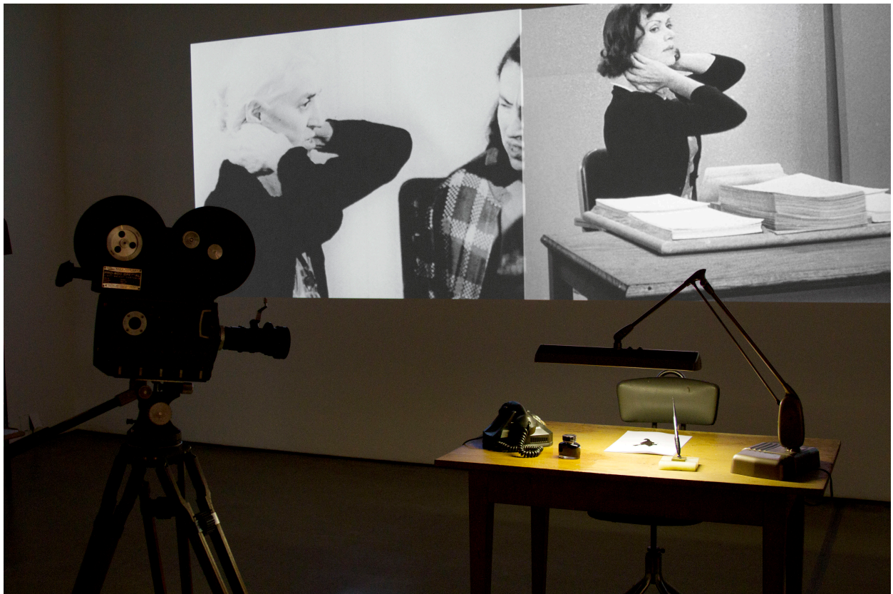
Large gallery - 3 channel video projection with vintage 16mm camera, desk, chair, telephone, lamp, fountain pen