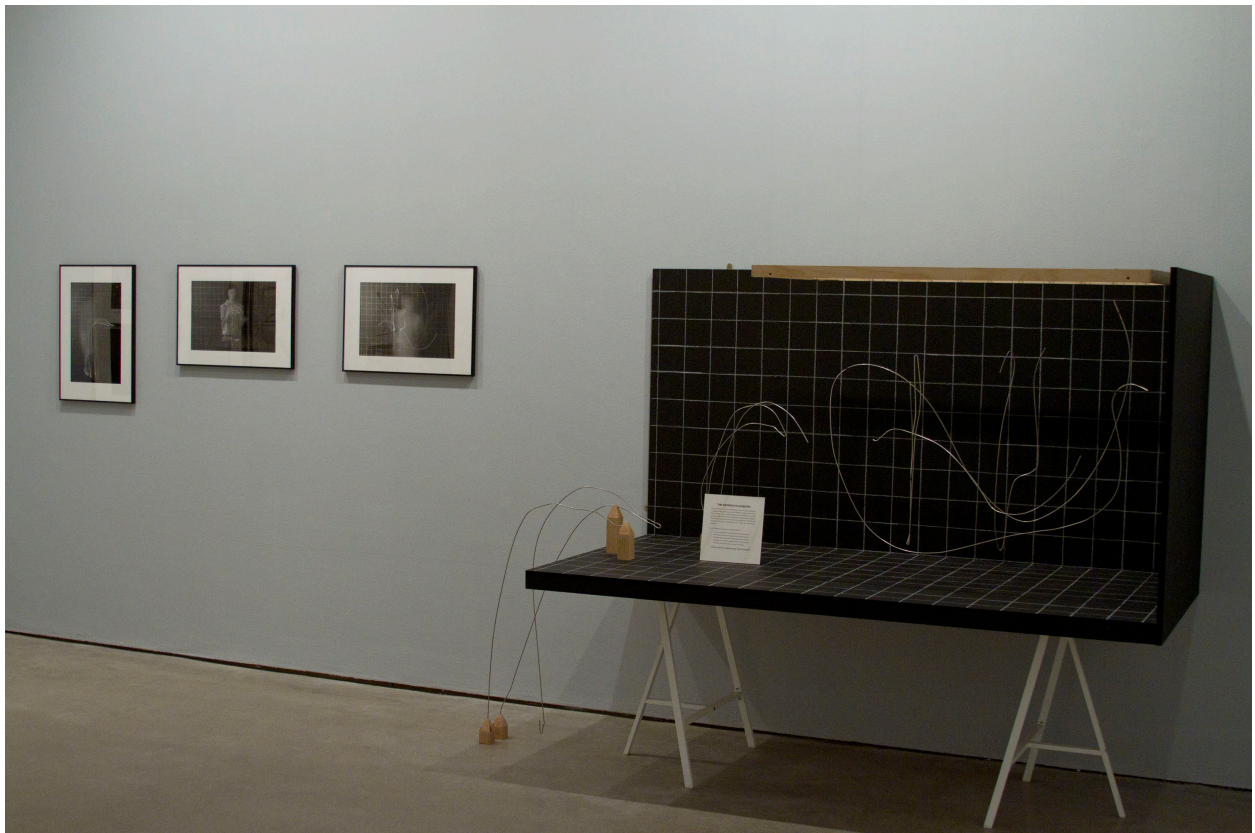
Small gallery - chronocyclograph photographs and wire models