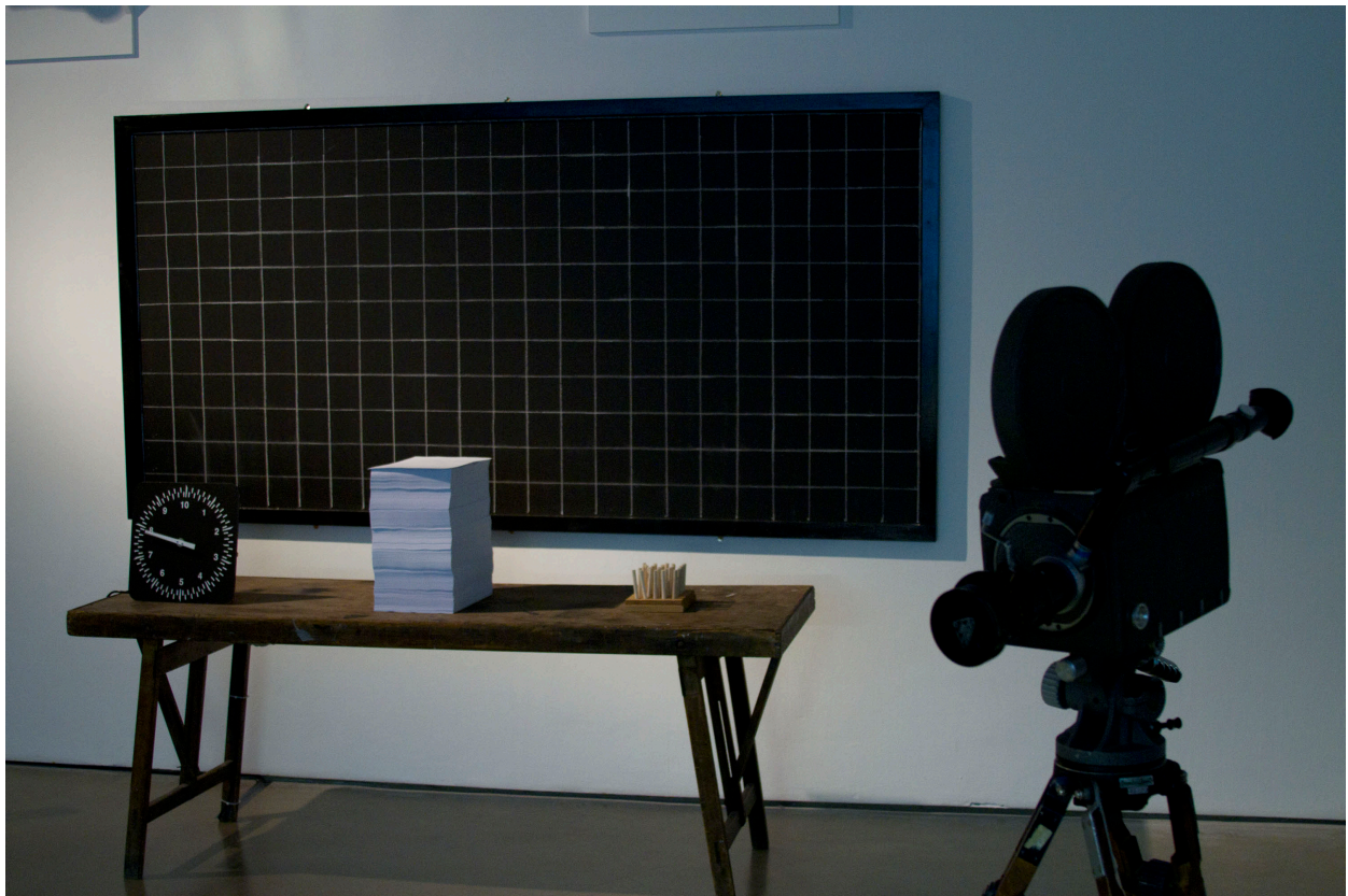
Large gallery - blackboard, clock, paper, pegboard and 16mm camera