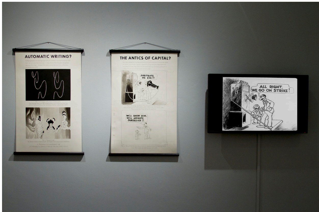
Small gallery - wall charts (ink on paper), flatscreen monitor playing On Strike (1920)