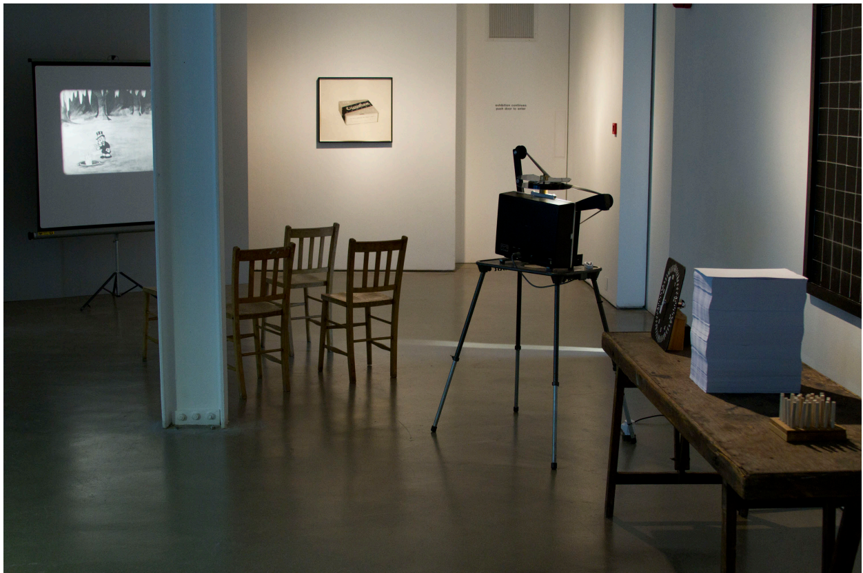
Large gallery - 16mm projector and loop