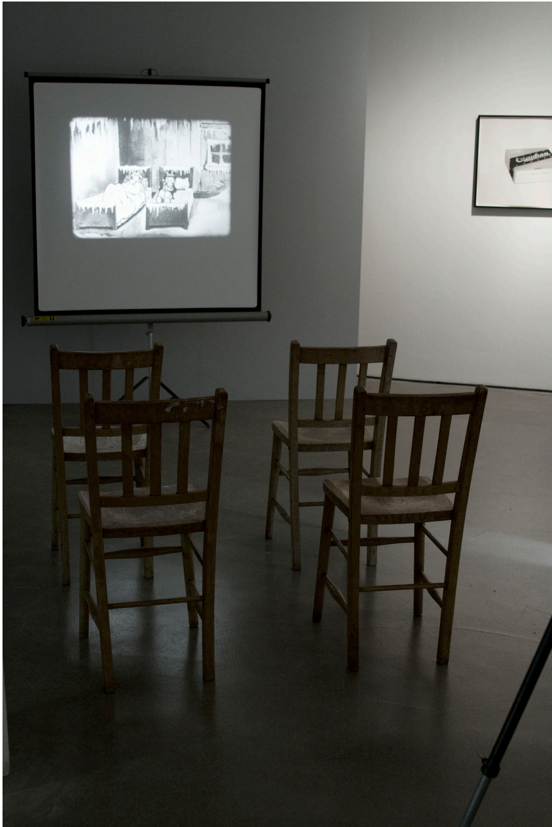
Entrance - The Infernal Dream of Mutt and Jeff , 16mm archival film projected with a 16mm film looper.

Installation views - Site Gallery Sheffield (2011)