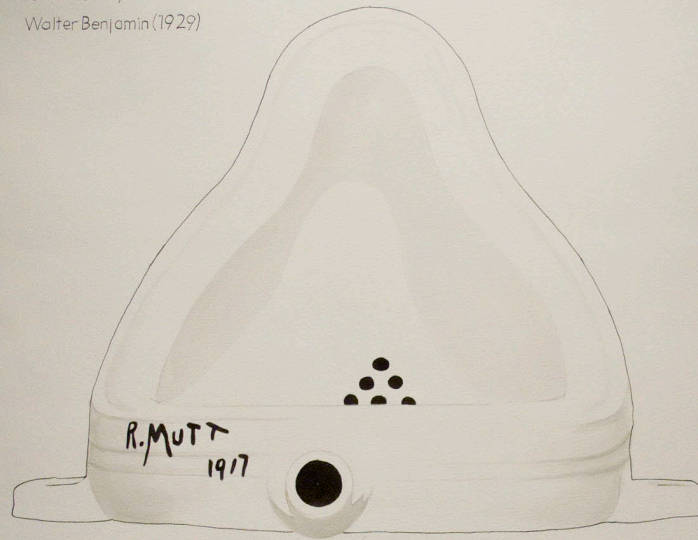
Fig. 1 - R. Mutt exhibits 'Fountain' (1917)