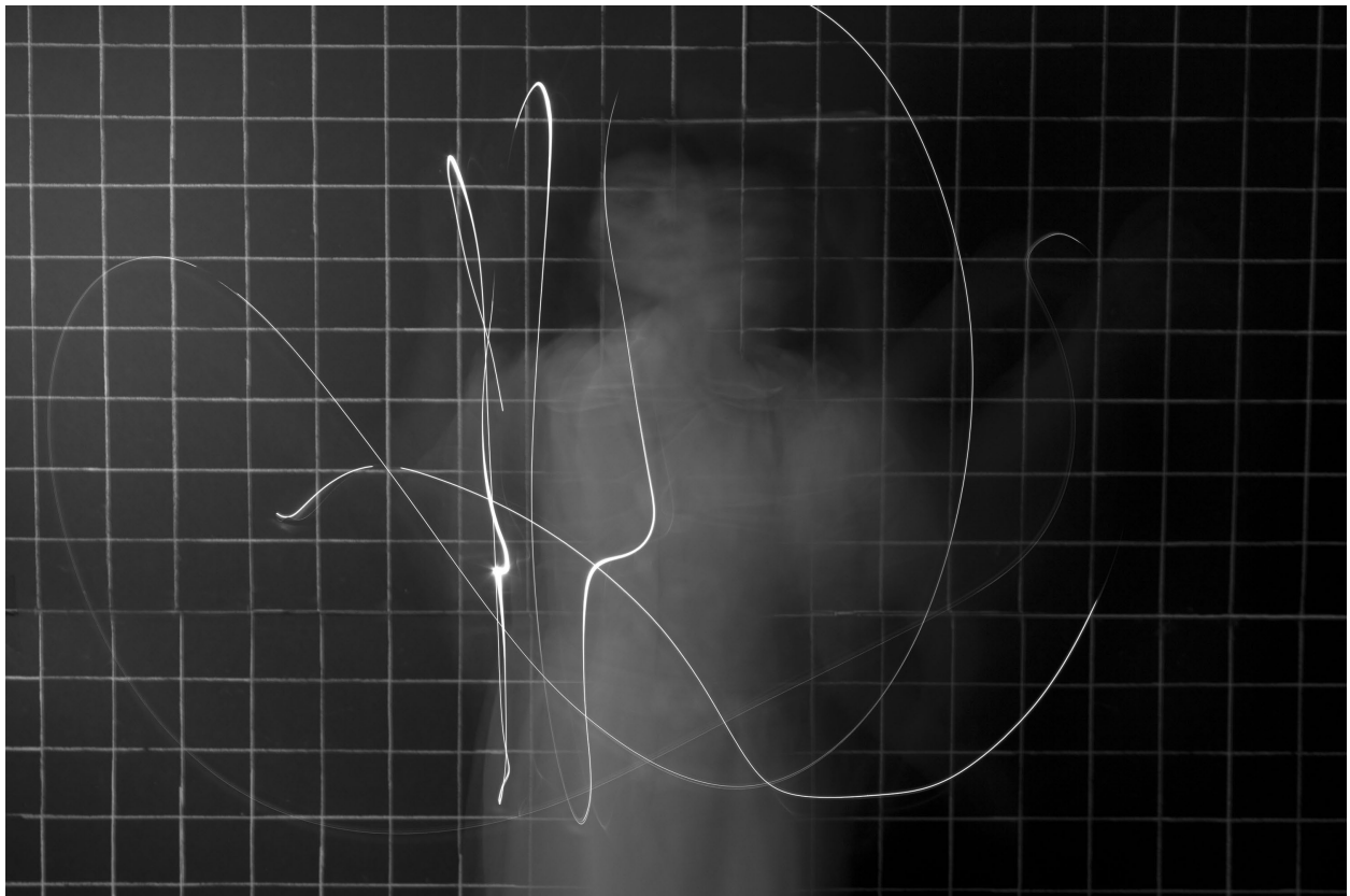
Small gallery - chronocyclograph photograph - conducting an orchestra